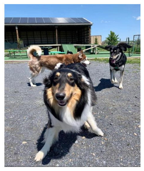
Solar in action at Dog's Day Farm, a participant in MEA's Clean Energy Rebate Program.

After being approved internally by MEA programmatic staff, applications then need to be entered into the State's financial system